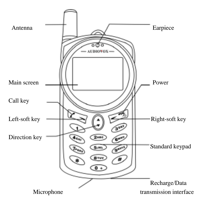
The Front Schematic Layout

This handset has a 128 64 LCD white and black display screen.